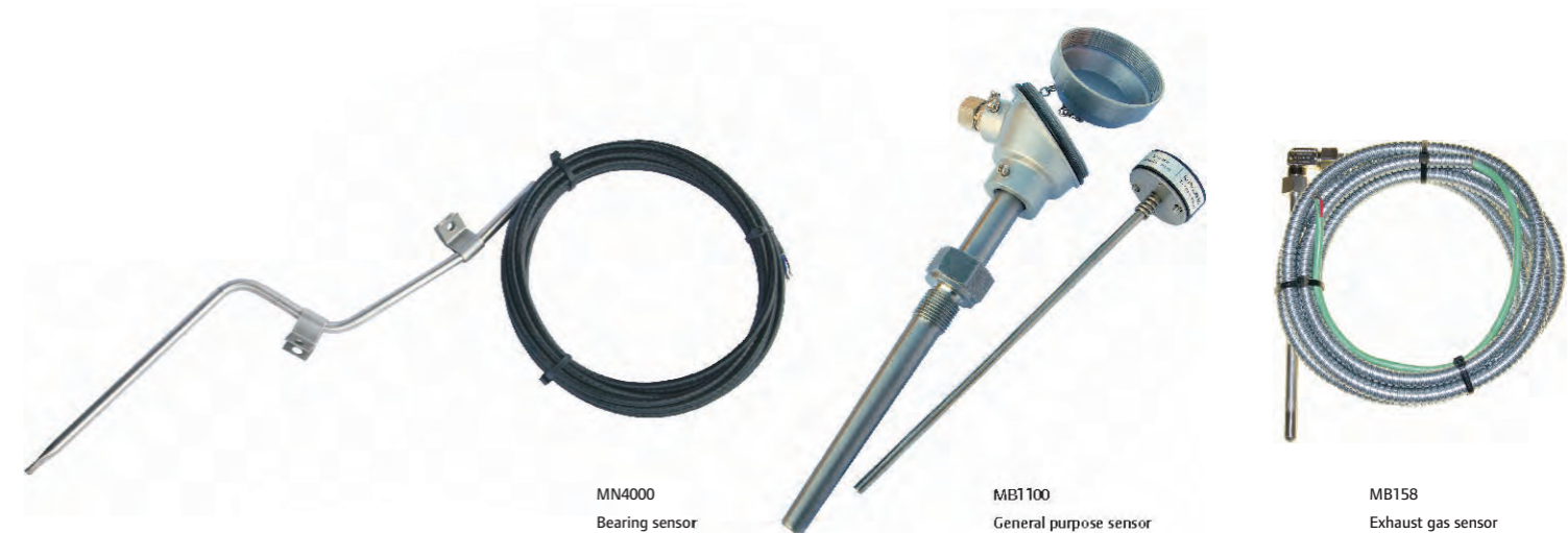
MN4000 Bearing sensor