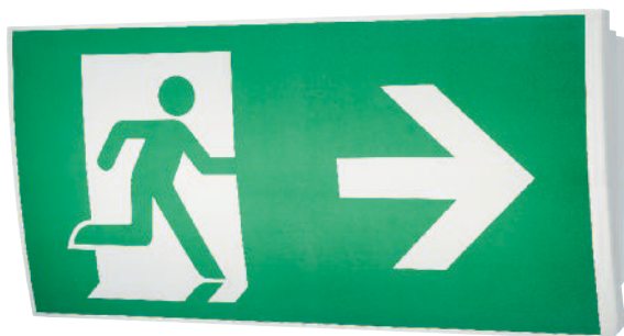
EC Signs Directive format