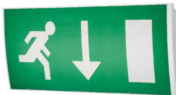
ISO sign format